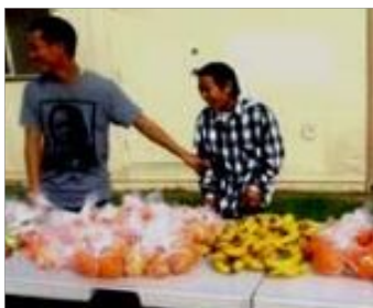
Young Hmong farmers at the farm stand

Farming in California should be a profitable enterprise. In particular, Fresno County could be considered an agricultural mecca – which is what drew many Hmong farmers to the central valley originally. Boasting annual agricultural sales of more than $3.5 billion, Fresno County alone produces more than some states. However, on closer examination of the USDA census statistics, you can see that the majority of Fresno's farmers have a gross income from farming that is less than $100,000 annually, and