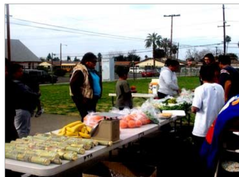
Customers peruse the produce

Most recently, NHAFFI started a farm stand at a local elementary school. Every week, we provide students, staff and community members with fresh, locally grown produce at $1 per bag. We facilitate a connection between farmers and the community at large and are very excited to see kids running to pick up bags of produce.