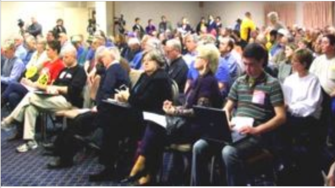
Thursday night's town hall meeting