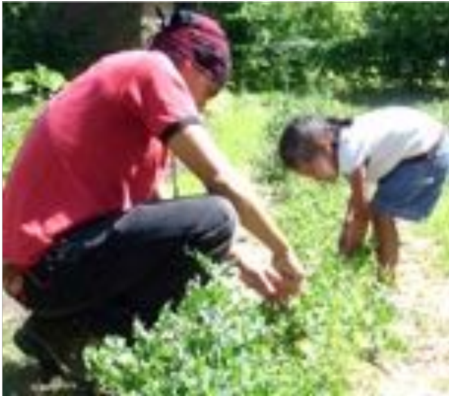
Chako in the garden with a young student

The point I'd like to make is that the overall cost of a Mvskoke diet is actually much, much less than the diets we live on today.