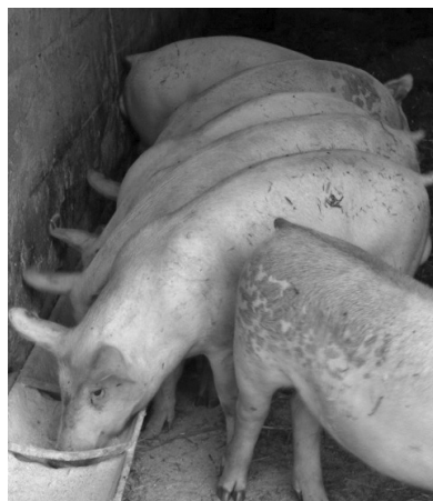
Hogs bred for industrial production are genetically uniform.

What do companies gain from limiting the breeds of livestock raised? Some analysts argue that